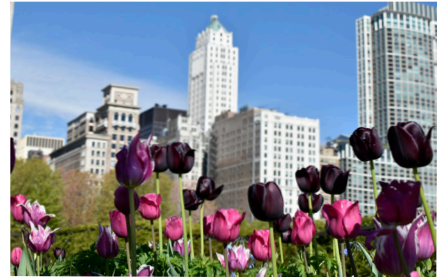
Lurie Garden's bulb display against the Chicago Skyline.