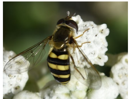
Flies can be pollinators too!